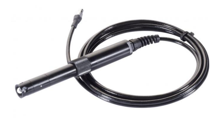
Possible extension (example): pH sensor