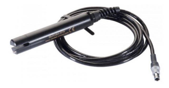
Conductivity and temperature sensor

Note: all brackets for pole diameter 40-60 mm.