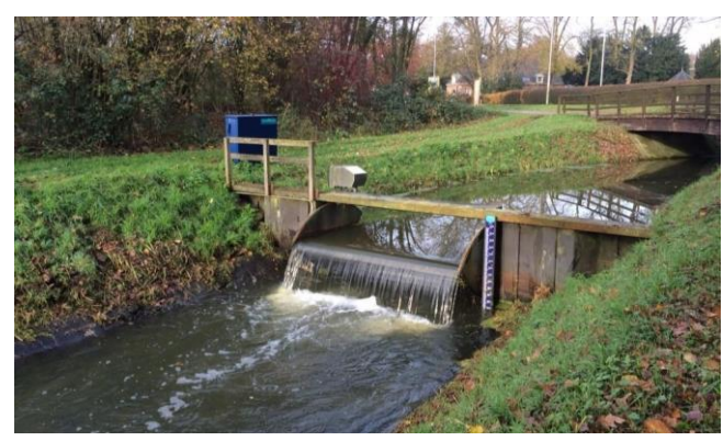
Example of a weir

In addition to the economically very attractive system described here, we also offer a low-maintenance version, called 'Low-maintenance online salinity measurement'. You can find the brochure on our website.