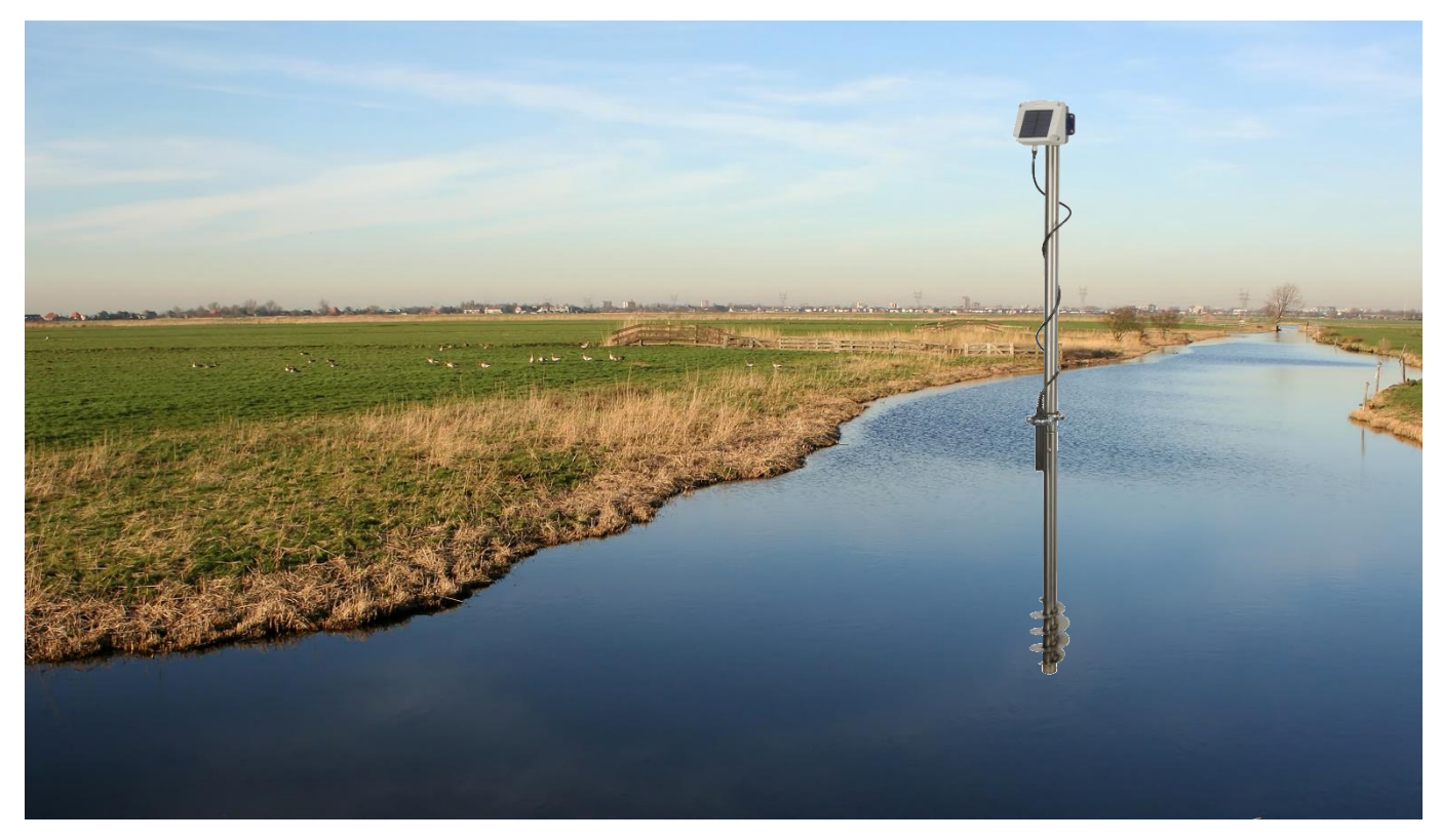
Compact measurement setup for online measurement of salinity