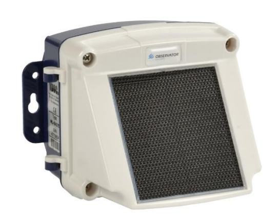
OMC-044 data logger