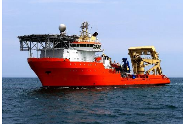
MRU3000 installed in function of an Observator HMS