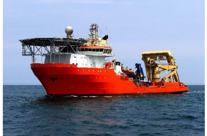
MRU3000 installed in function of an Observator HMS