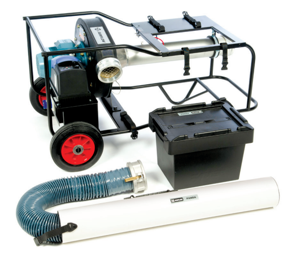
Carry Weight: 45 kg (99 lbs.) with Instrument Box and Flex Carrying Tube Removed.