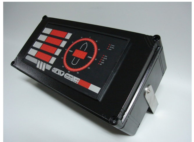
Black Line version in Optional housing