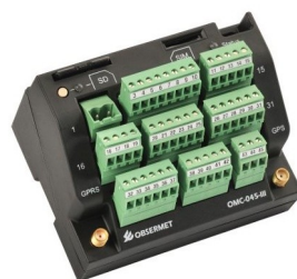
OMC-045-III data logger with GPS and GPRS.