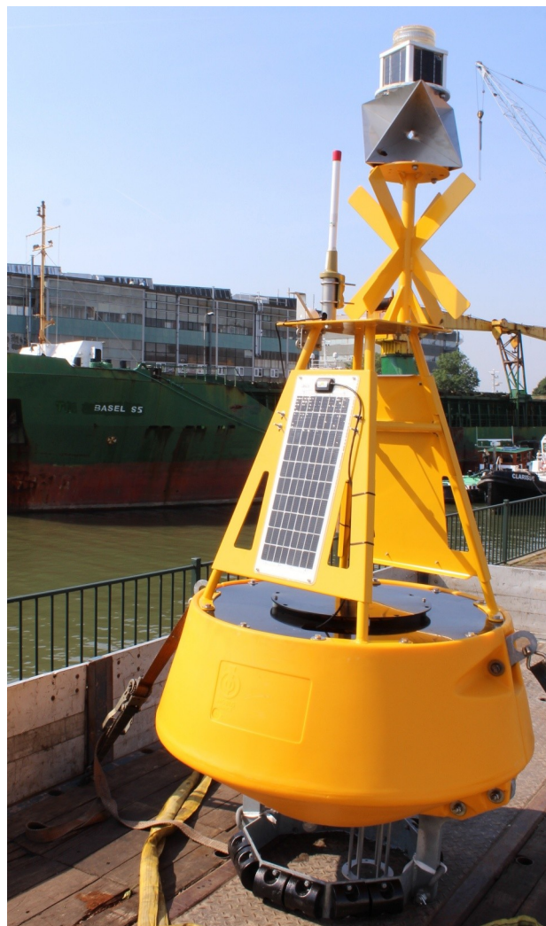
OMC-7012 data buoy, typical configuration.