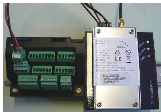
OMC-045-III data logger with optional Iridium satellite modem