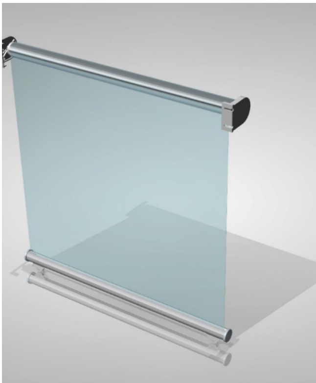
Visi-Plus Light with chain guided