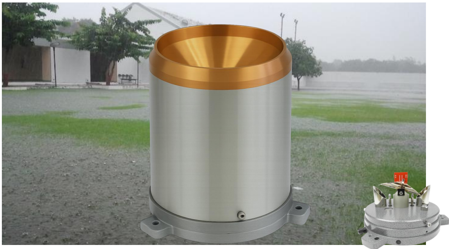
Suitable for general meteorology – hydrology – flood warning systems – remote and long-term logging deployments