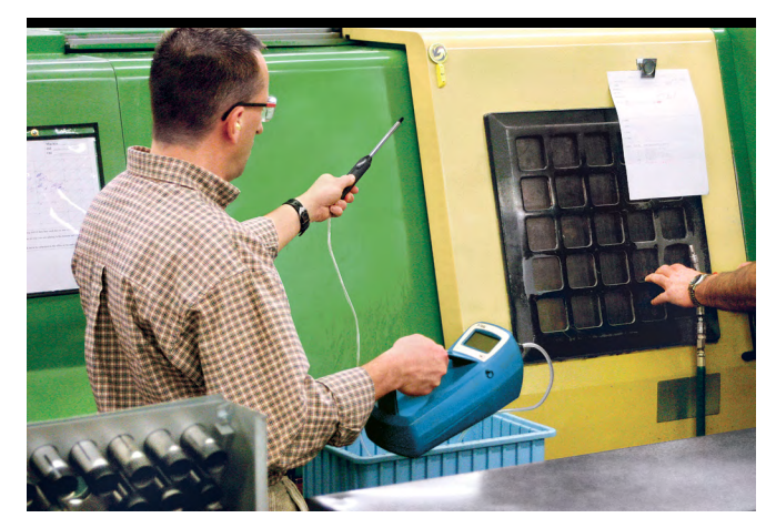
P-Trak Ultrafine Particle Counter and accessories includes: Telescoping Sample Probe, Shoulder Strap, Inlet Screen, Spare Wicks (2), Alkaline Batteries, Alcohol Fill Capsule with Storage Cap, Reagent Grade Isopropyl Alcohol, Zero Filters (2), Carrying Case, TrakPro<sup>m</sup> Software, Computer Cable, Operation and Service Manual, Calibration Certificate, and Two-year Warranty.

PC with Microsoft Windows® 2000 or XP; Windows-compatible printer; 5 MB hard disk space; and available RS232 serial port (for downloading)