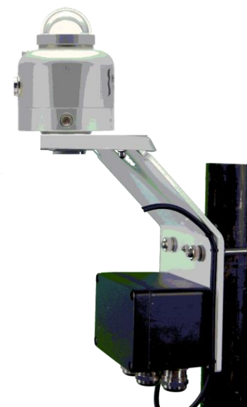
OIC-604 Global Solar Radiation Node