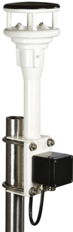
OMC-116M (Marine Type Bracket)