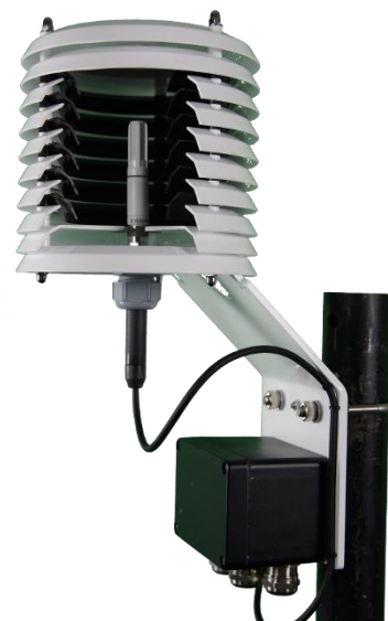
OIC-406 Temperature Humidity Node