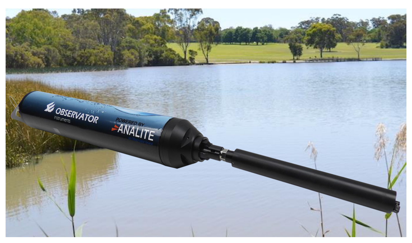
Suitable for long-term turbidity & temperature monitoring & logging