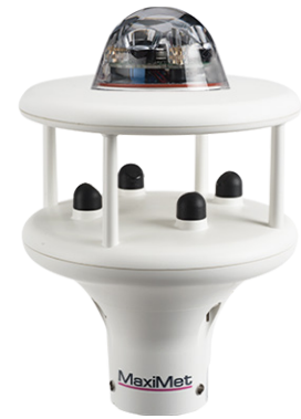
MaxiMet GMX240 measures 3 parameters including precipitation