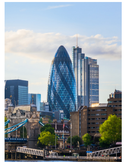
MaxiMet compact weather stations are integrated into systems monitoring gas and particulate concentrations in the air.