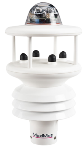
MaxiMet GMX600 measures 6 parameters including precipitation.