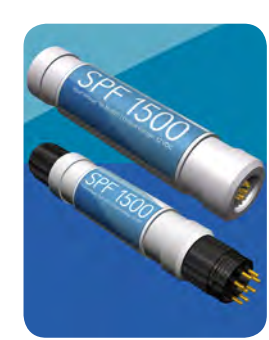
SPF1500 protects against fluctuations in power and communications over long cable lengths.