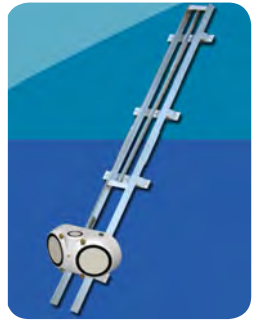
Canal Mount for installation in open channels.

Useful options and accessories make the SonTek-SL a complete, turn-key solution!