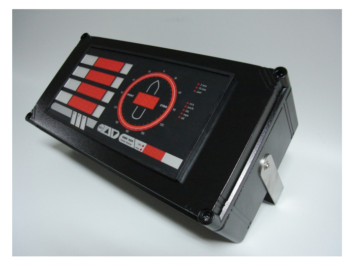
Black Line version in Optional housing