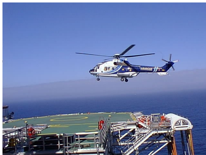
Helicopter approach on platform