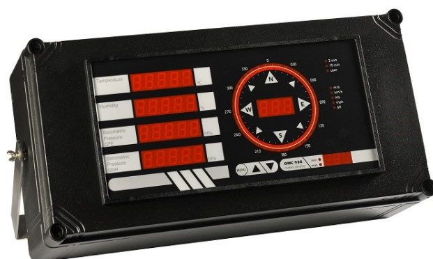
Black Line version in Optional housing