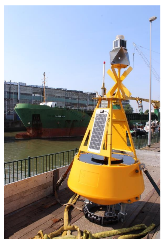
OMC-7012 data buoy, typical configuration