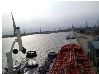
OMC-160 installed on a Tanker